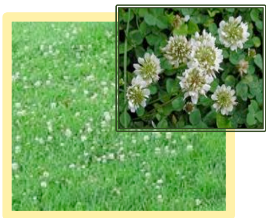
Dutch white clover blended with lawn grass. Inset: Close up of clover flower.

Here are a few of the many options for lawn alternatives, including suitability, cultural requirements, comments, etc. Click here for information about low-water turf seed blends.